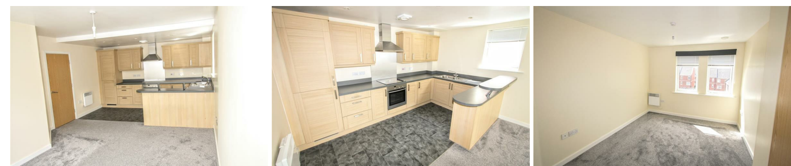
Stylish 2-Bed Apartment with Parking – West End, Darlington Modern living in a sought-after development with lift access, secure entry, and great transport links.

This lovely two-bedroom apartment on the third floor of the popular Glaisdale Court development, right in the heart of Darlington's prestigious West End. With the benefit of secure intercom entry, a lift for easy access, and your own allocated parking space, this home offers both comfort and convenience. Properties here are always in high demand, so we recommend arranging a viewing as soon as possible.